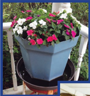
Mosquitos breed in plant saucers