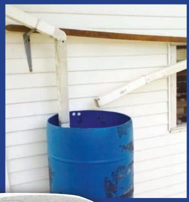
Mosquitos breed in rain barrels that aren't covered with screening